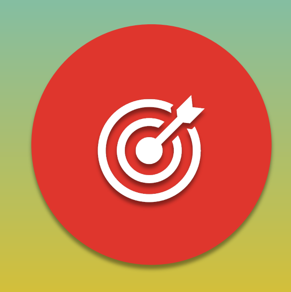
3. THEIR ASSIGNMENT