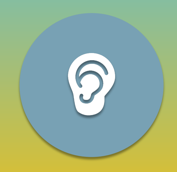
2. THEIR ALERTNESS