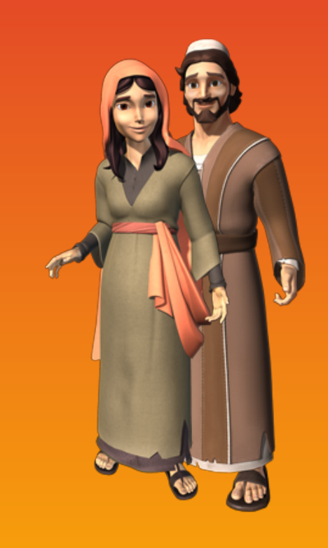
MARY & JOSEPH