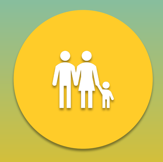
1. THEIR AGE